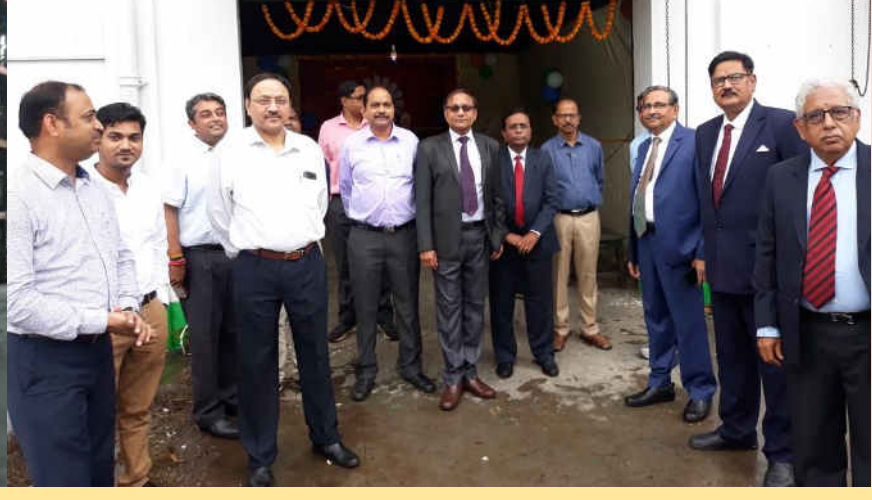
Vishwakarma Puja was celebrated with much fervour in the offices and plants of the Eastern Region on 18 th September 2019. The Directors took time out of their busy schedule and visited HRC for the puja.