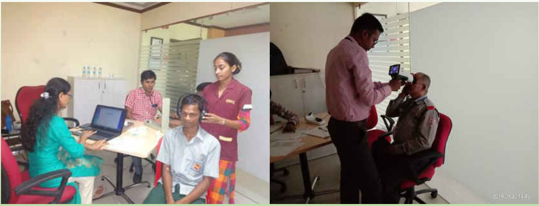
The annual medical check-up camp was organised for employees at G&L, Silvassa on 20 th September and an eye check-up camp was organised on 30 th September.