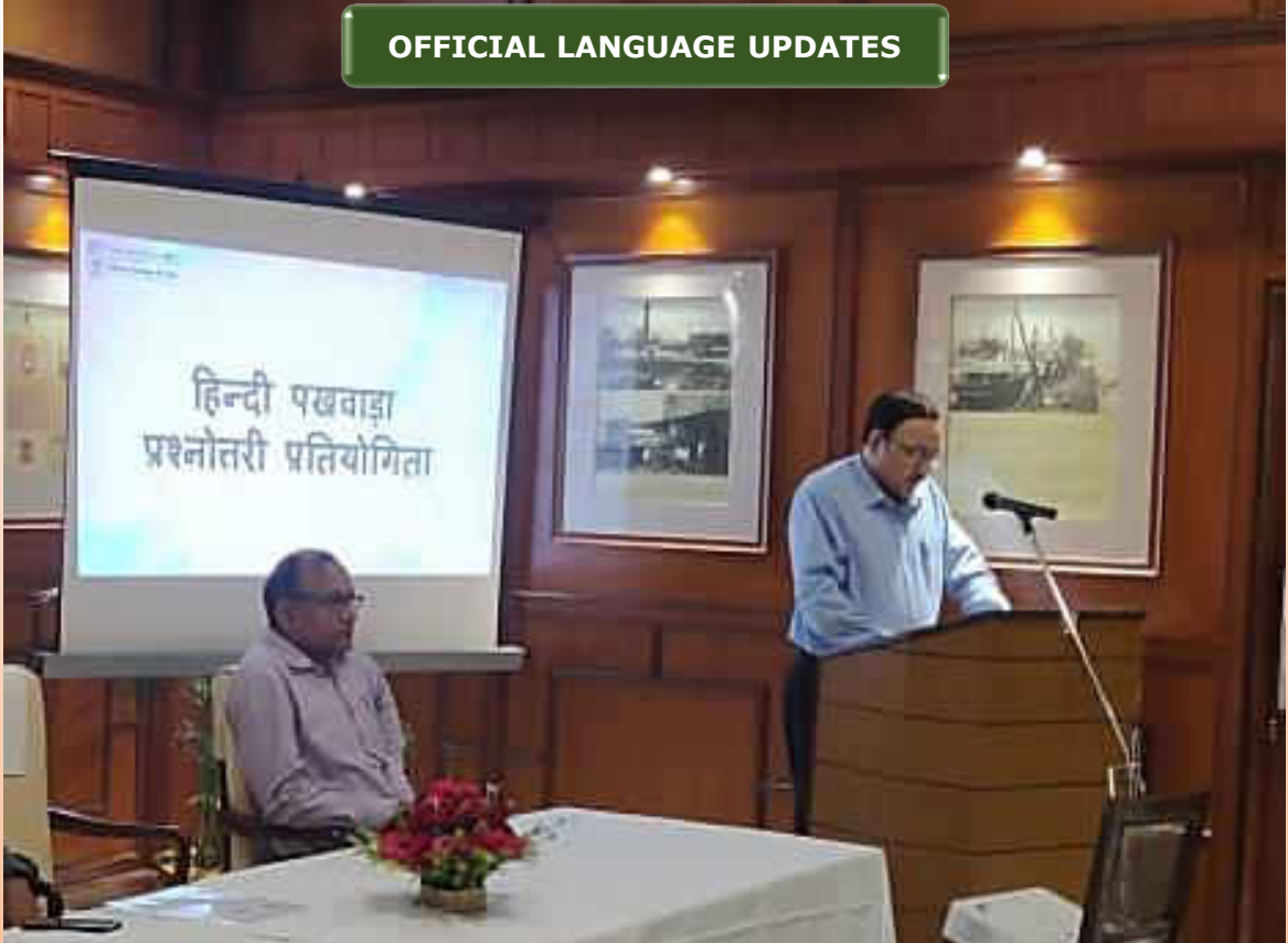
To promote Hindi as the official language, Balmer Lawrie organized 'Hindi Pakhwada' from 14 th to 28 th September 2019 in the Eastern Region. A host of events like quiz, extempore, essay and administrative glossary writing competitions were organized for the employees. A hasya kavi sammelan was organized during the closing session of the pakhwada. Similar programs were organised across regions pan India as part of Hindi Pakhwada celebrations in the month September 2019. Details of the celebrations will be published in the October 2019 issue of Balmer Lawrie Organisational Gazette (BLOG).