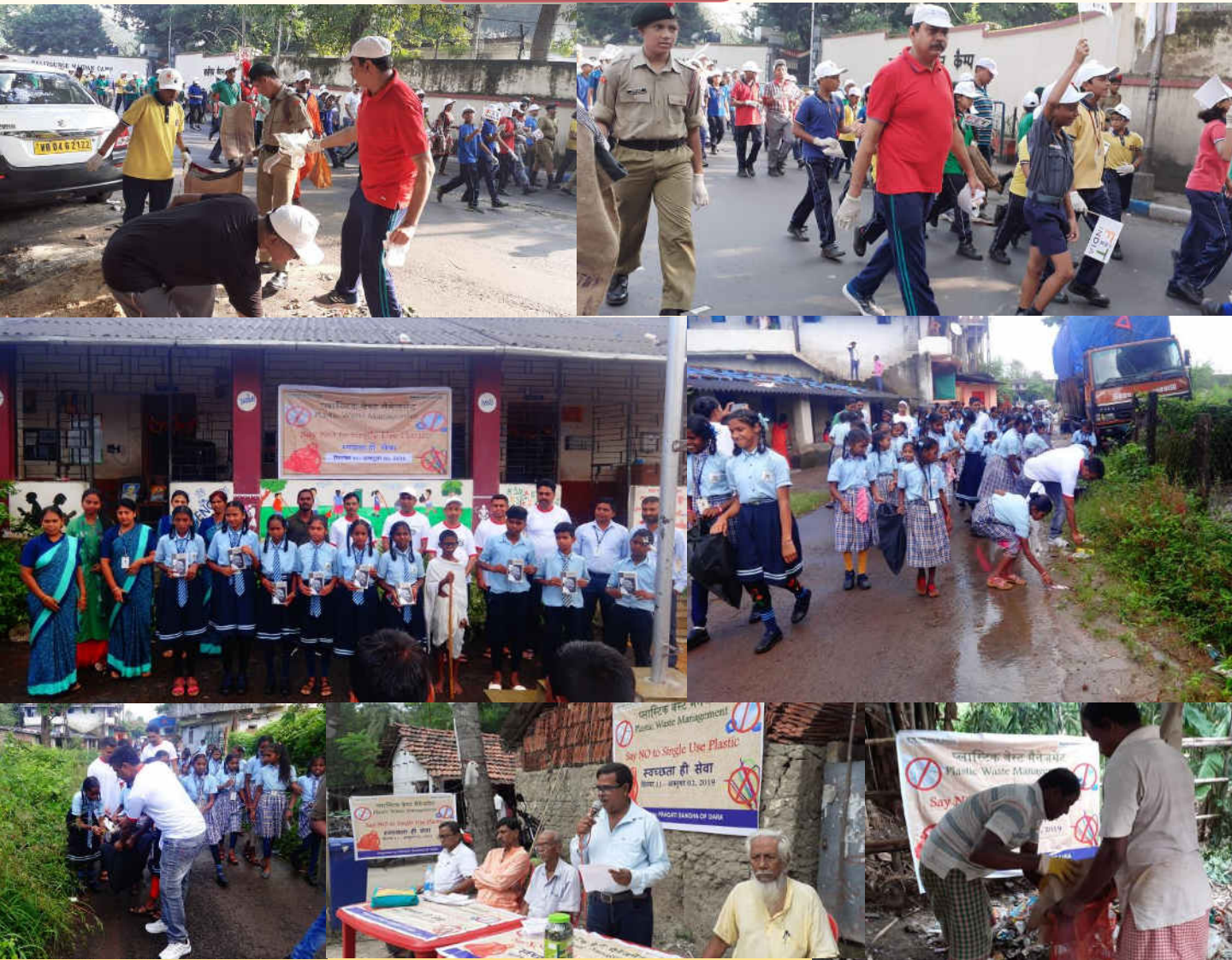
As part of Swachh Bharat Abhiyan, Swachhata Hi Seva (SHS) was organised from 11 th September to 2 nd October 2019. Hon'ble PM has furthered the movement in a new avatar, where he has urged citizens to ban single use plastic. At Balmer Lawrie, various SHS activities like shramdan, swachhata rally and awareness workshops on saying 'No' to plastic, distribution of jute bags, plogging etc. were organised in Silvassa and Kolkata in association with schools and implementation partners.