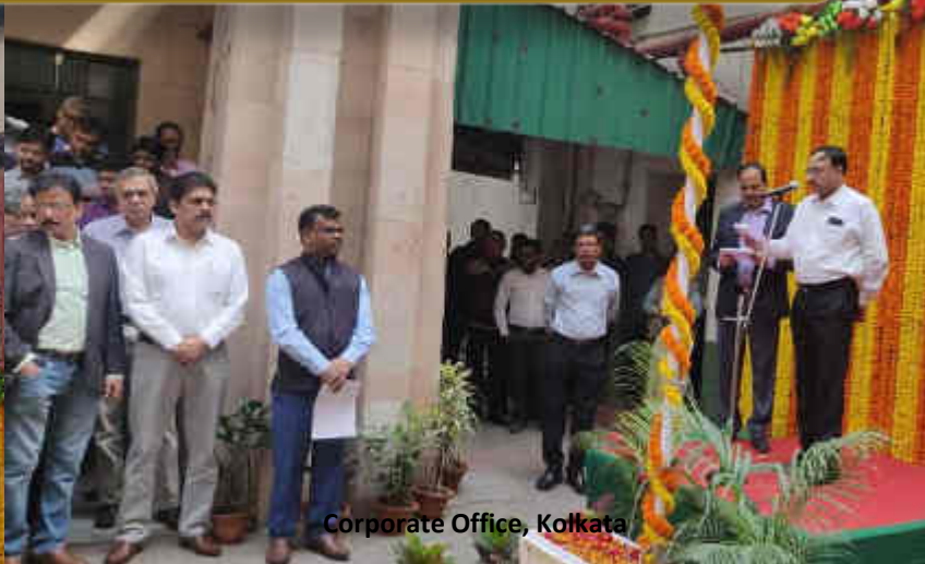
Corporate Office, Kolkata