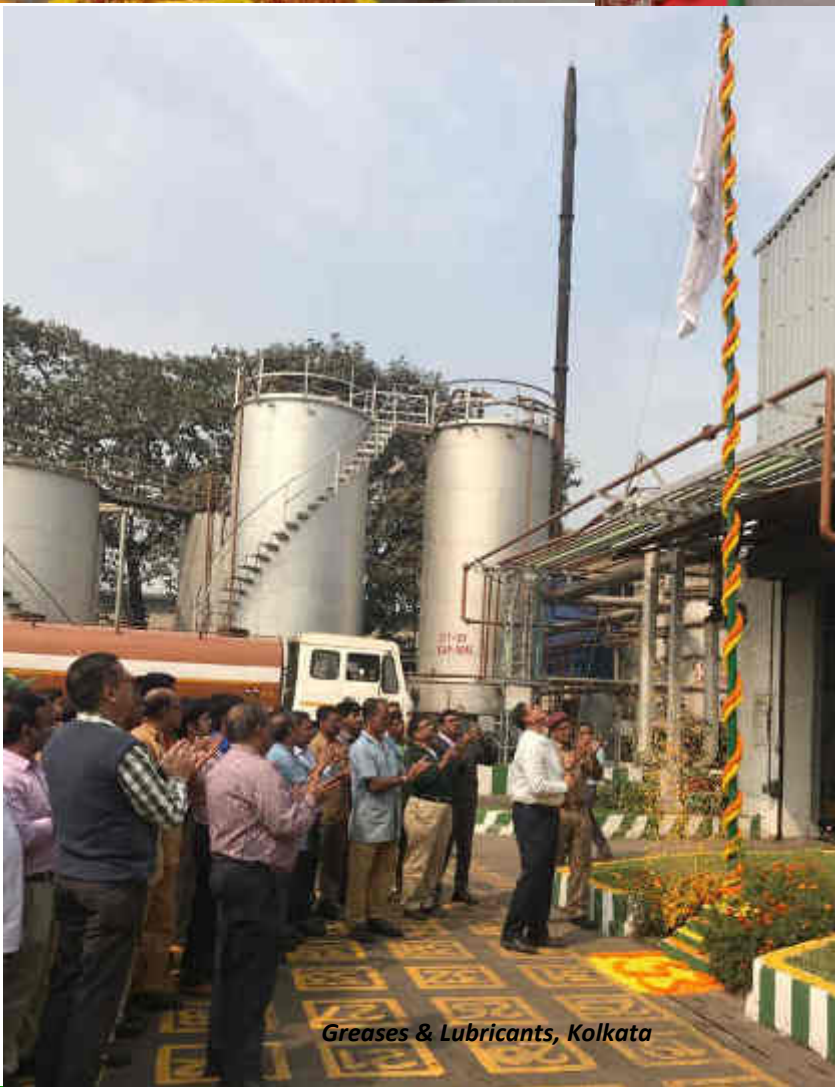
Greases & Lubricants, Kolkata