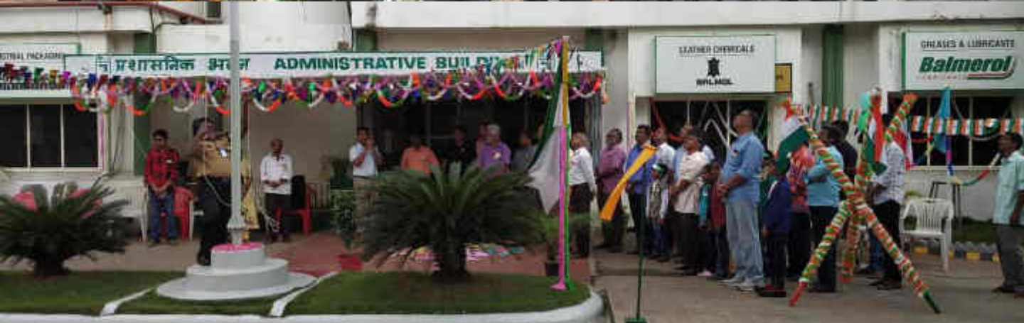
Republic Day was celebrated with much fervor in units and establishments across the company. In photo are glimpses from IP - Kolkata, IP - Navi Mumbai, Silvassa, Sewree and Manali, Chennai.