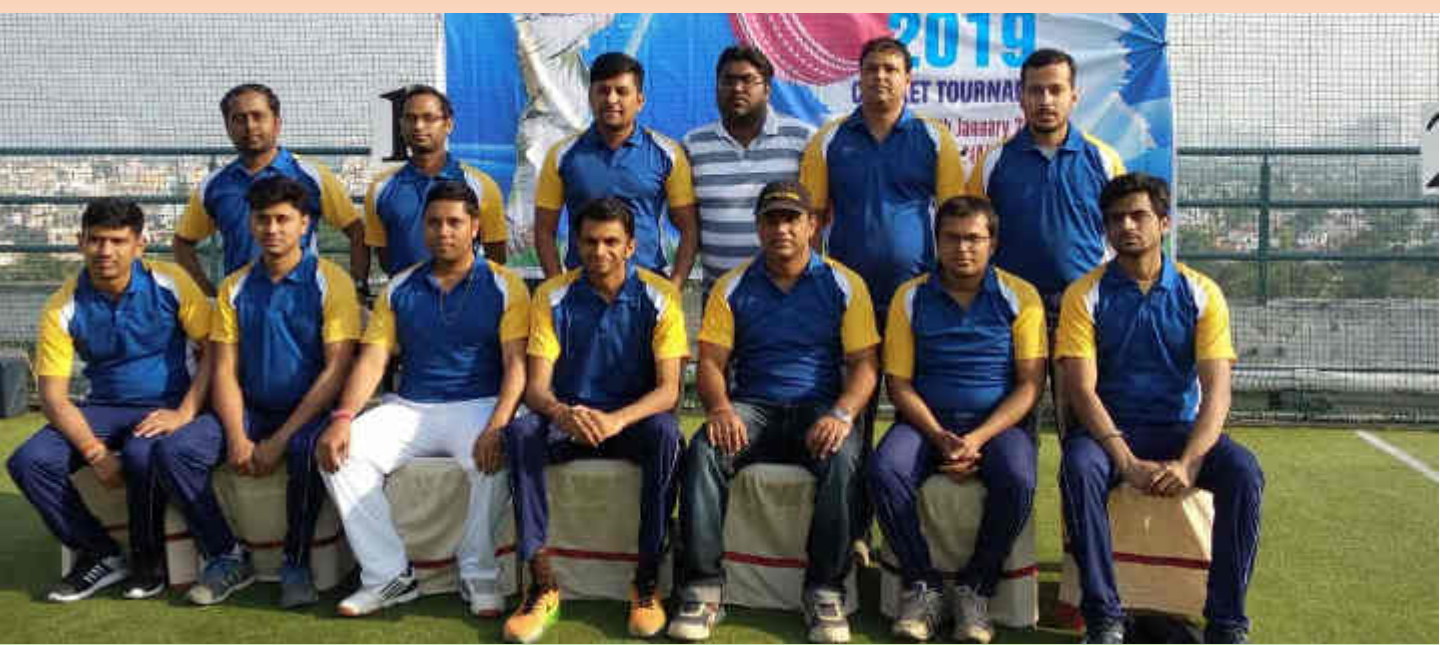
Balmer Lawrie participated in the JAK Premier League 2019 cricket tournament organized by JAK Maritime & Logistics India Pvt. Ltd. on 5 th January 2019 at AMP Baishaki Cricket Turf Ground. The event saw the participation of more than 20 teams from the trade and business including Kolkata Port Trust, shipping lines, transport vendors and clearing & forwarding agents.