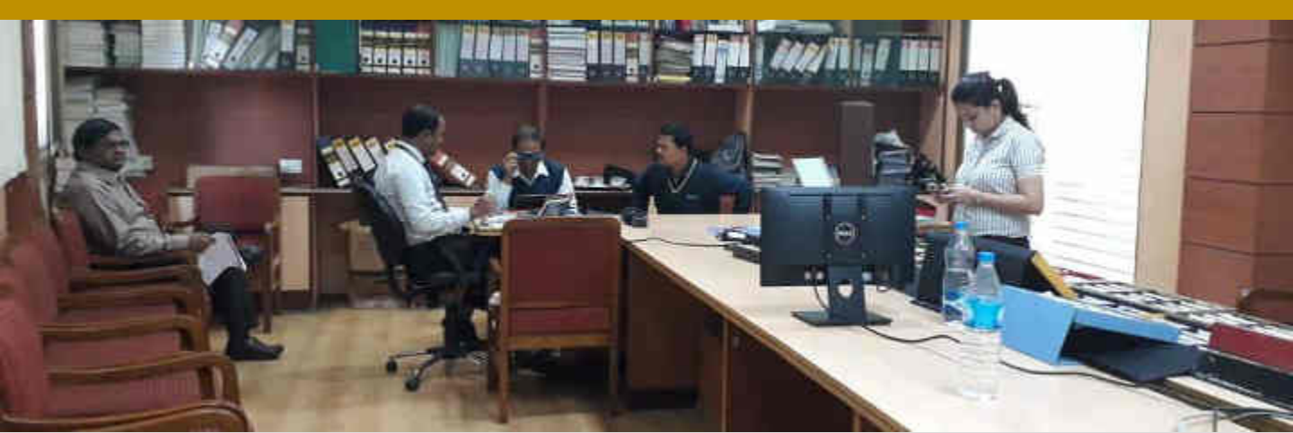
A Corporate Eye Screening Program (CESP) was organised in association with Lawrence & Mayo for employees in the Corporate Office at Kolkata on 11 th January 2019. The 10 step precision eye tests included case history, visual acuity test, objective refraction with auto refractor, subjective refraction, duochrome test, pupillary reaction test, muscle balance test, colour vision test, eye examination using slit lamp, counselling and management. The employees actively participated in this program.