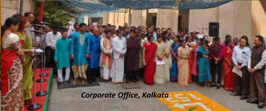
Corporate Office, Kolkata