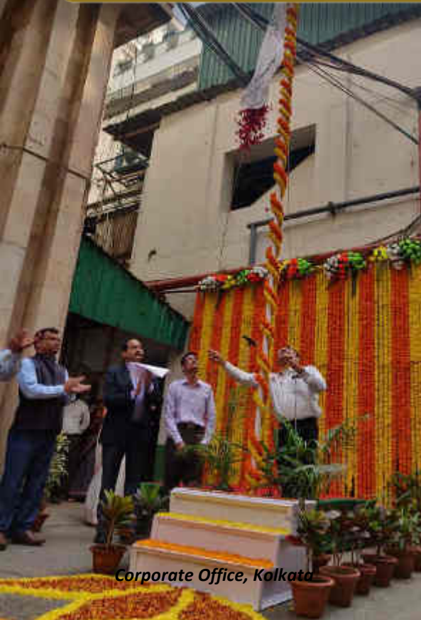
Corporate Office, Kolkata