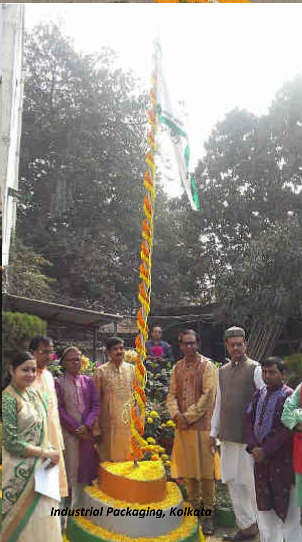
Industrial Packaging, Kolkata