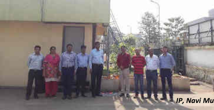
IP, Navi Mumbai