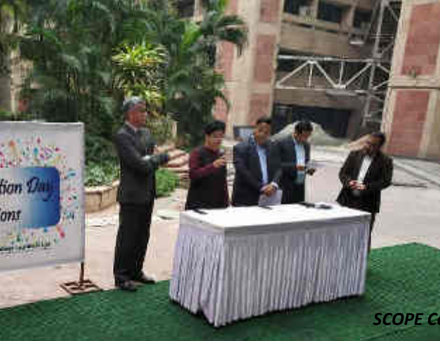
SCOPE Complex, Delhi