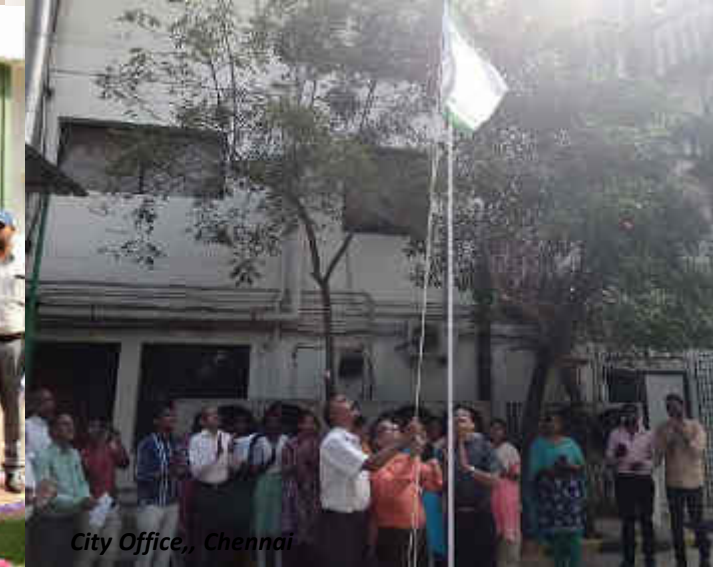
City Office,, Chennai