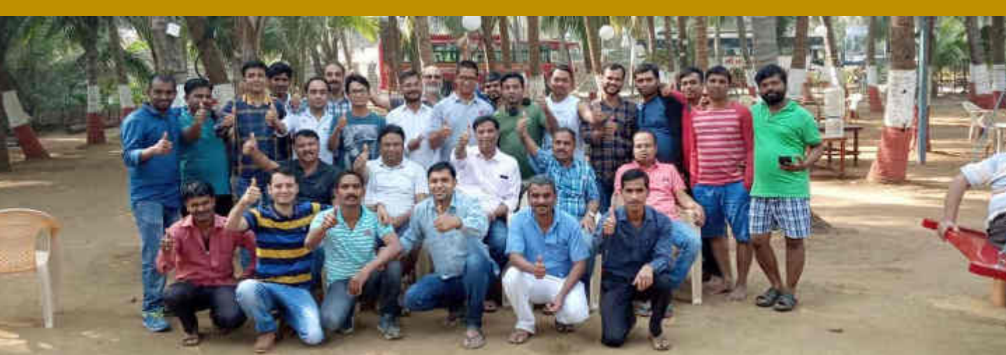
A one day get together was organized for the Industrial Packaging, Navi Mumbai team at Kihim Beach, Alibaug on 19 th January 2019, in recognition of their remarkable performance.