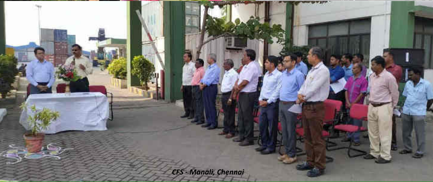
CFS - Manali, Chennai