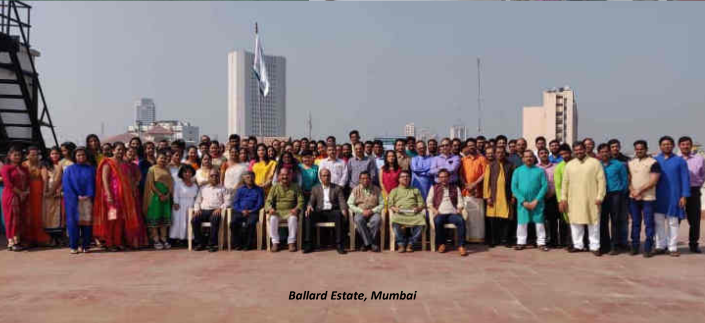
Ballard Estate, Mumbai