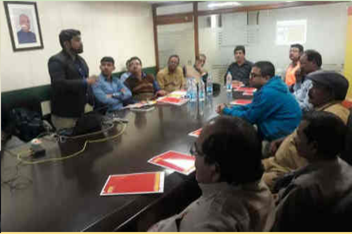
A health check-up camp and a financial planning session was organised for employees in CFS, Kolkata on 7 th January 2019. The employees benefitted immensely from both the sessions.