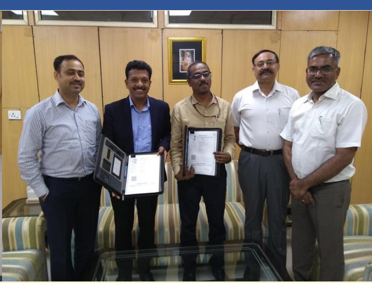
SBU: LI signed the agreement for "Operation & Management of Cargo Operations" of ICP Raxual with Land Port Authority of India (LPAI) in the month May 2018.