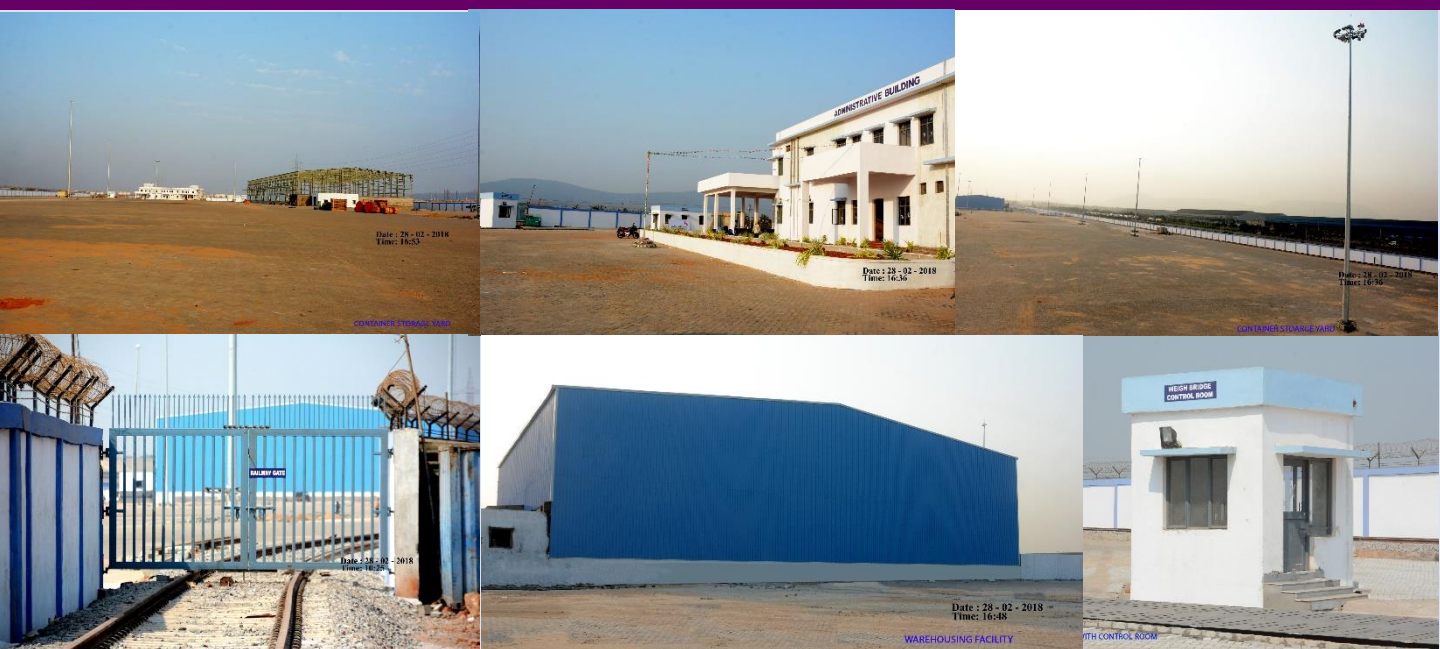
Balmer Lawrie is setting up a Multi Modal Logistics Hub at Visakhapatnam. Work is in full swing to make the site operational as per the target date. In photo are glimpses of the site.