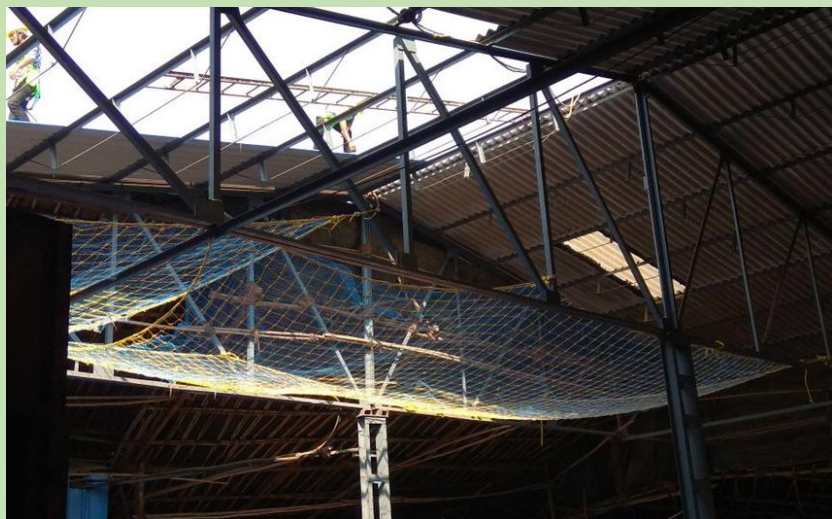
Use of safety net as secondary protection at IP, Silvassa while changing the roof sheets