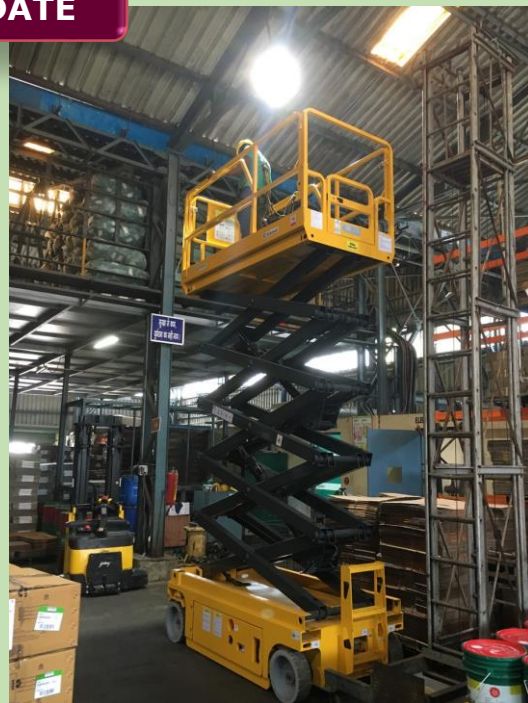
Use of scissor lift at G&L, Silvassa while working at height

Proper working at height is the 1 st Golden Safety Rule to be followed at Balmer Lawrie. The prime objective should be to eliminate working at height. If at all people are required to be engaged in working above 6 feet, they should undergo training on proper use of safety harness and use of fall arrestor system. Before a person is deputed for working at height, he should undergo medical check-up and should obtain fitness certificate from the competent authority. Safety net should be installed as a secondary protection while working at height. In case of use of scaffolding, only box type MS tubular scaffolding should be used with proper earthing of the scaffold. The scaffold should be inspected from time to time by competent authority for its stability. Ladder should not be allowed for working at height. Ladders can be used only to access height. Use of mobile elevated working platforms and scissor lifts are good ways by which we can ensure full safety while working at height.