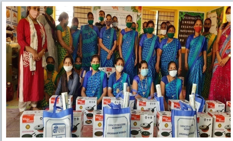
Figure 7: Livelihood for Women Program