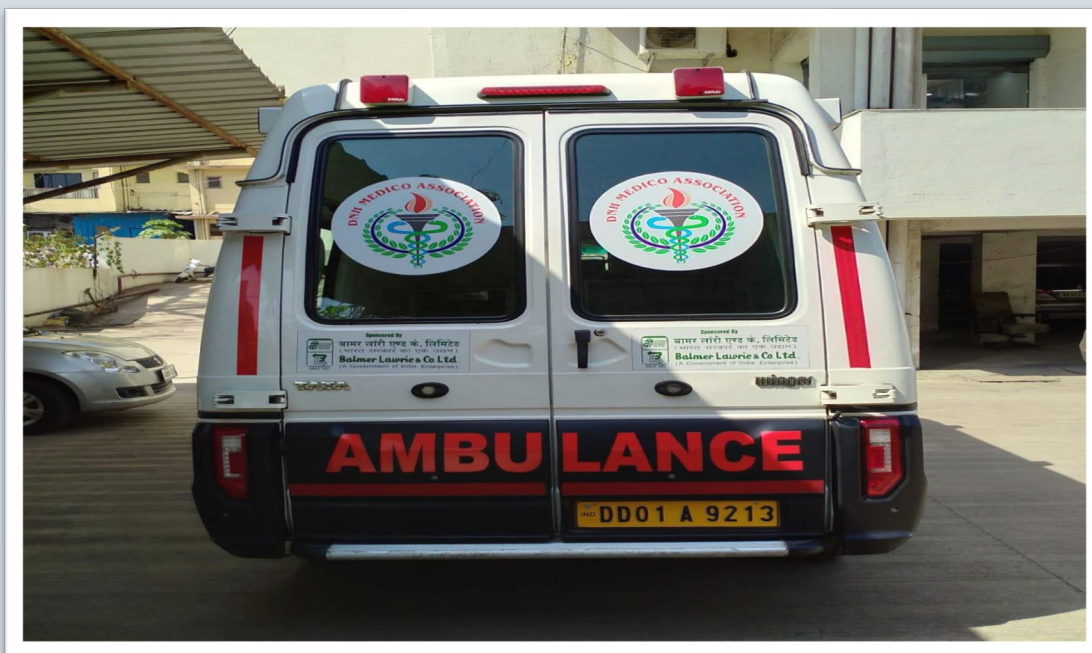
Figure 6: Cardiac Ambulance in Silvassa