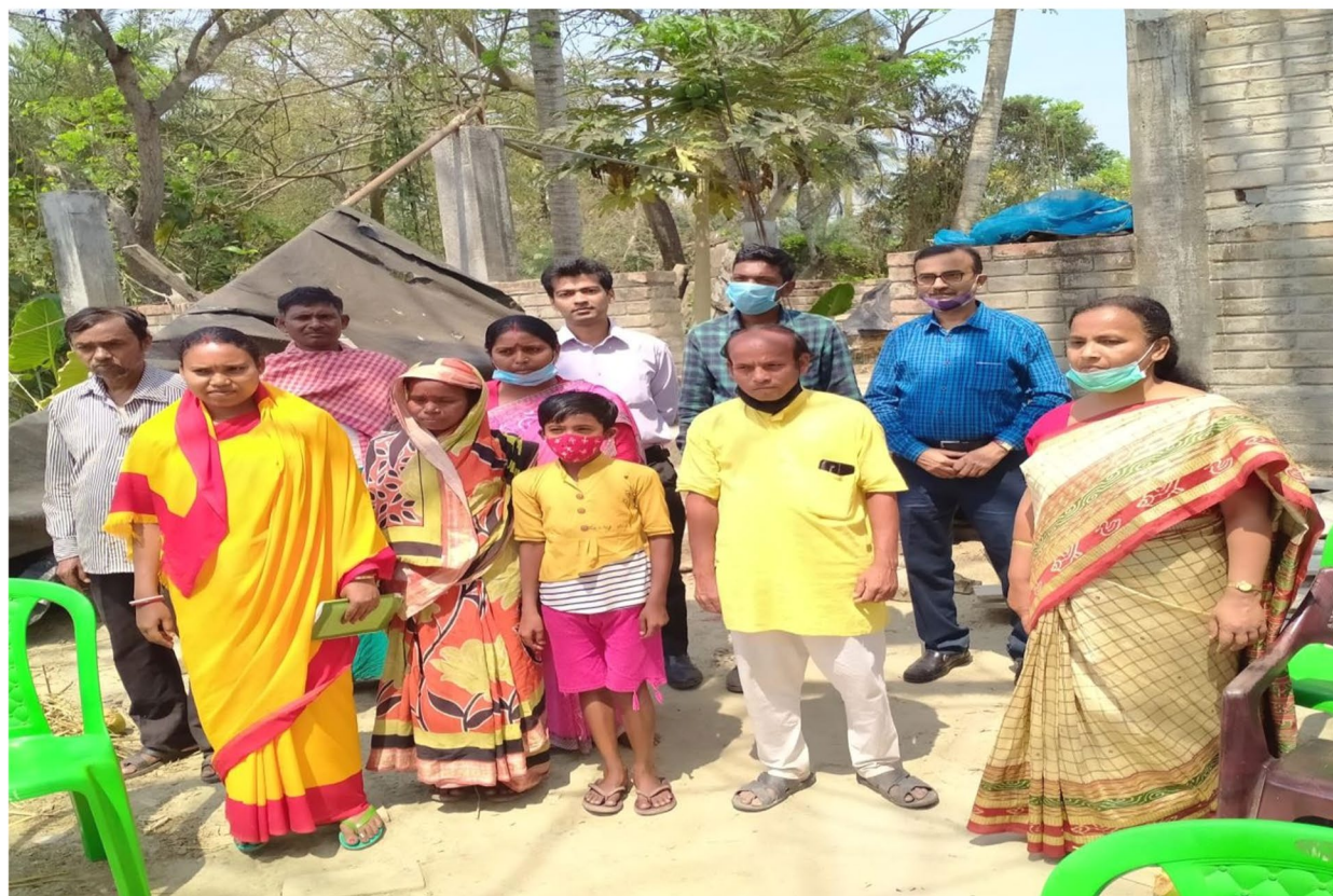
Figure 5: Ekal Vidyalay Visit