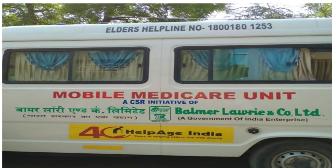
Figure 12: Branding of Van