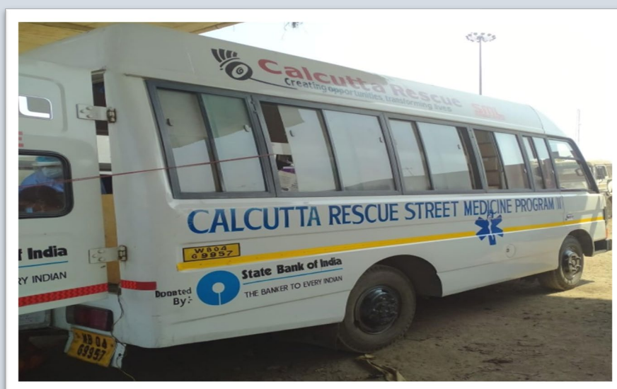
Figure 2: Calcutta Rescue Mobile Health Van