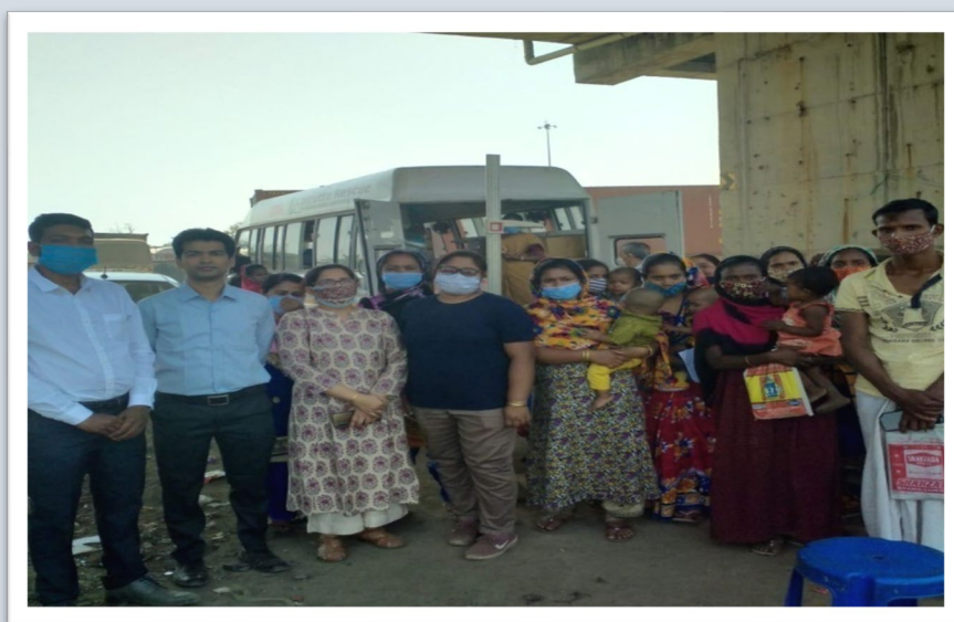
Figure 1: Calcutta Rescue Health Project in slum area

The overall rating for this project is 8 out of 10.