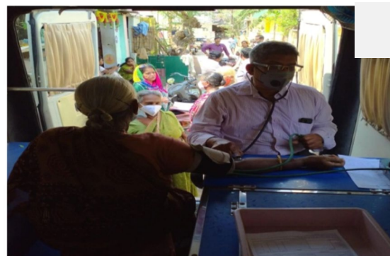
Figure 10: Doctor Check up inside the mobile van