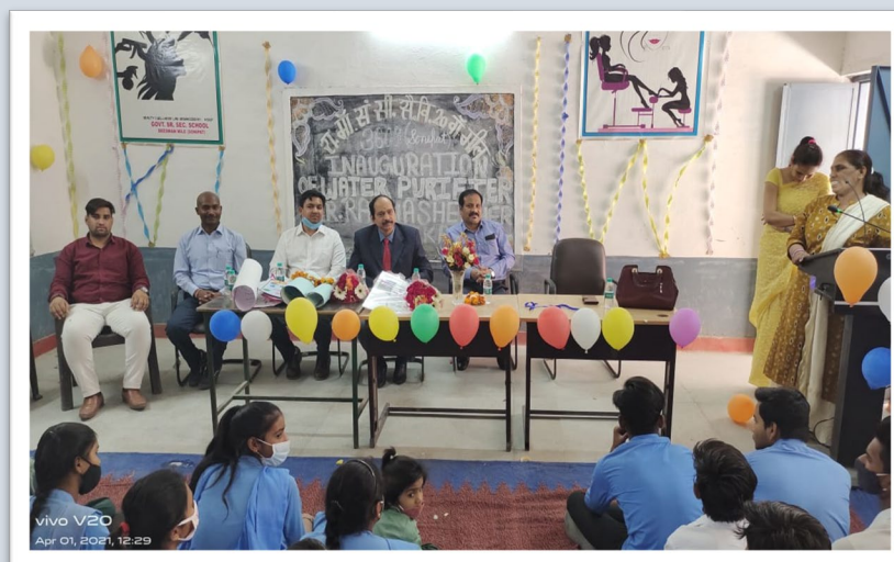
Figure 8: Interaction with school children