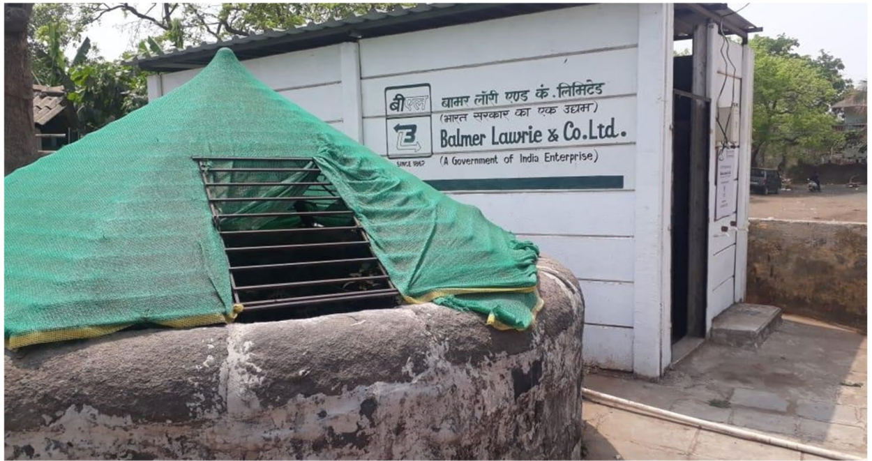
Figure 9: RO plant and covered well for drinking water supply

Name of the organization: Help Age India, Chennai