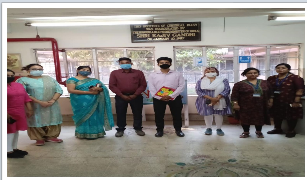
Figure 3: IICP Visit by the Research Team