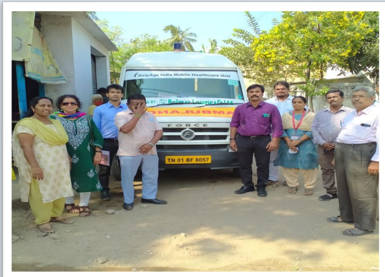
Figure 11 : HelpAge India Ambulance